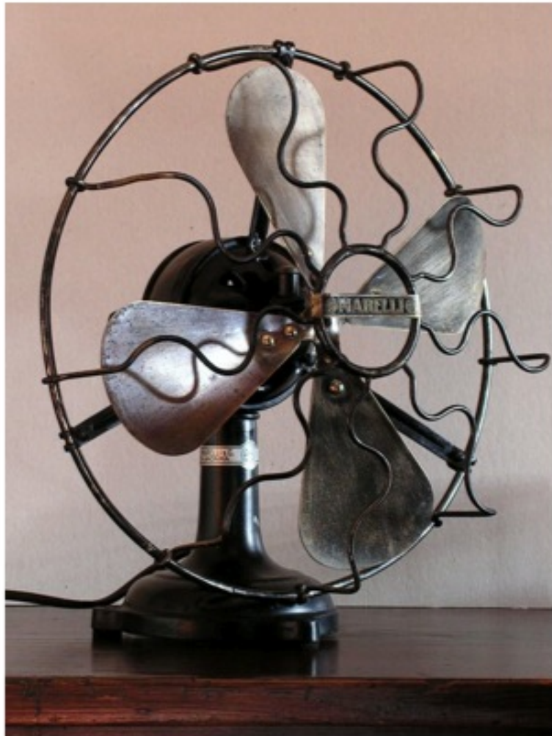
The Sciroccale, Tropicale and Boreale models with ball heads stayed in production until at least 1932