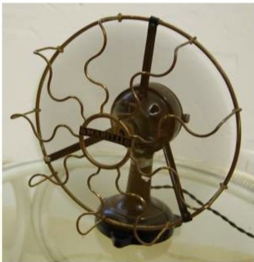
A 1924 Marelli Sciroccale