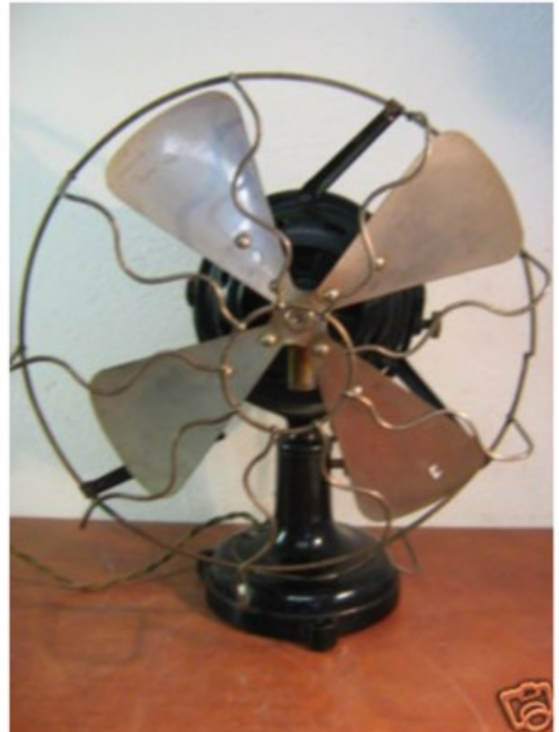
Simio (30 cm Pizza-shape blades) Simiu (40 cm Pizza-shape blades)