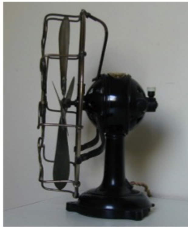
Oil cups over shaft