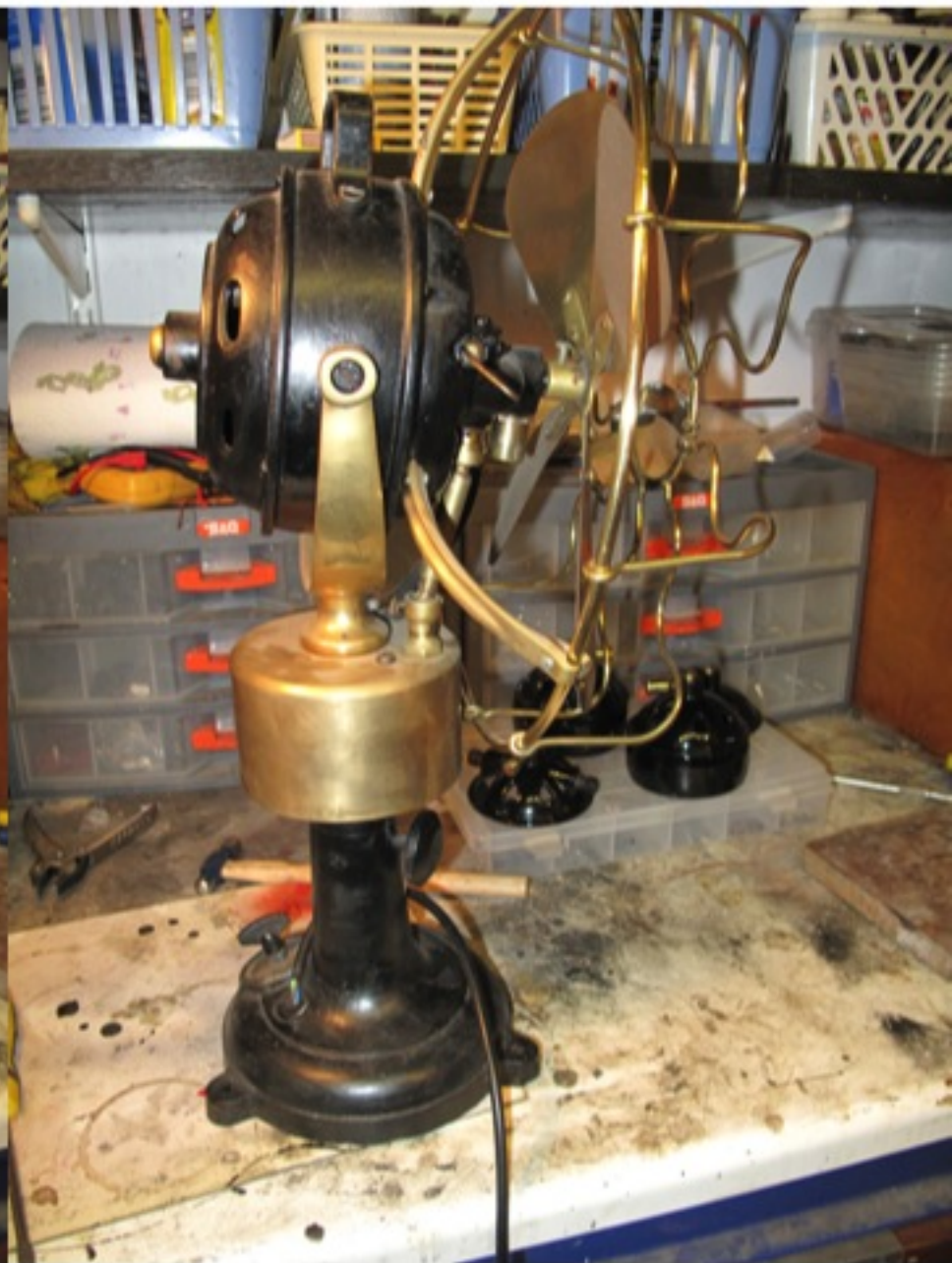
A Marelli that rotates 360°. 30cm blades and tab feet.