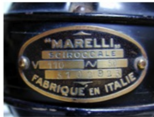
Sciroccale (26cm blades)