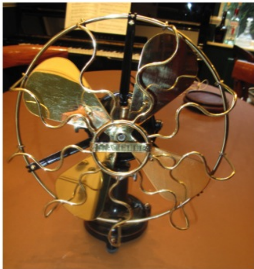
Phase 2 Marellis Prepared by Simon M. Cutting 2010