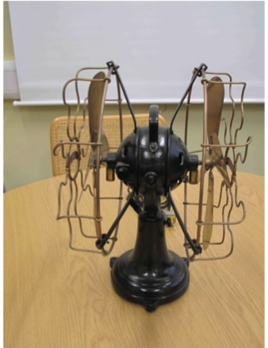
Phase 2 Marellis Prepared by Simon M. Cutting 2010